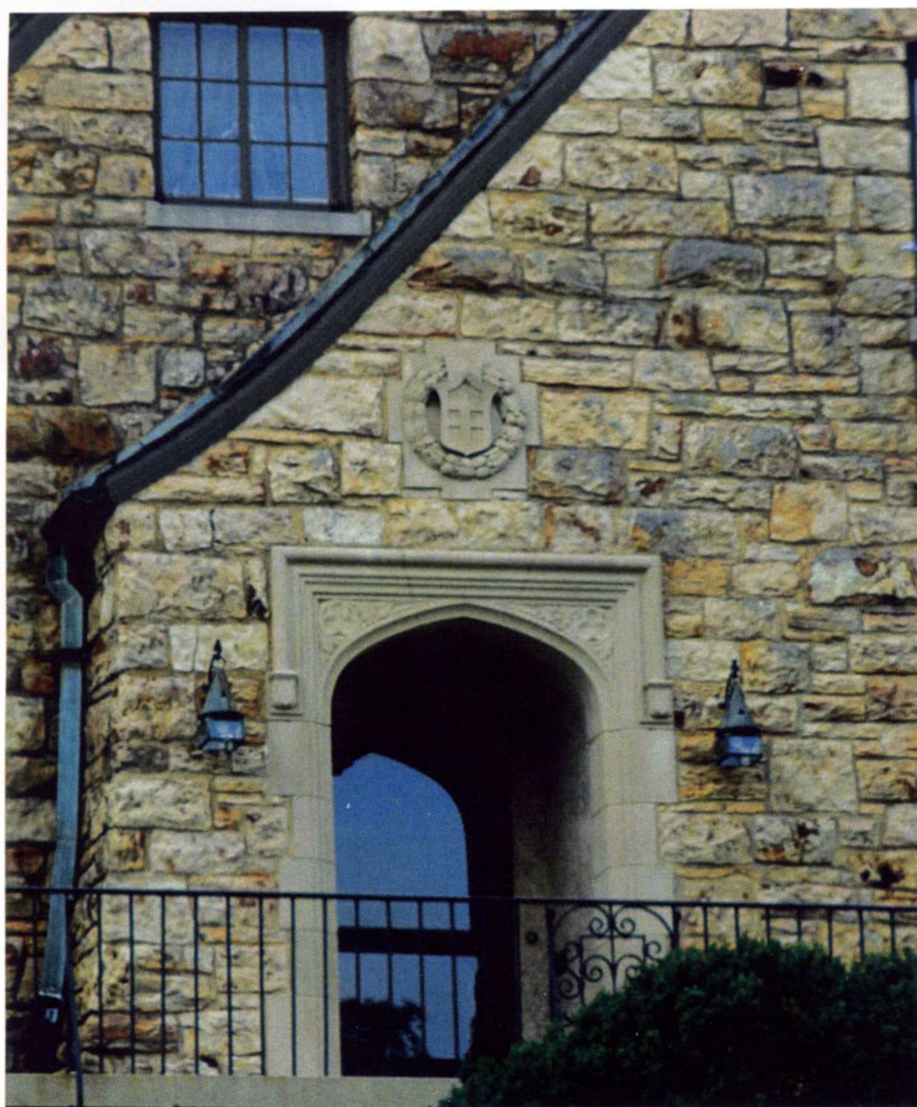
An example of a white sandstone that was quarried near the site. This color does not appear in this area often and is distinctly different from the typical orangish brown.