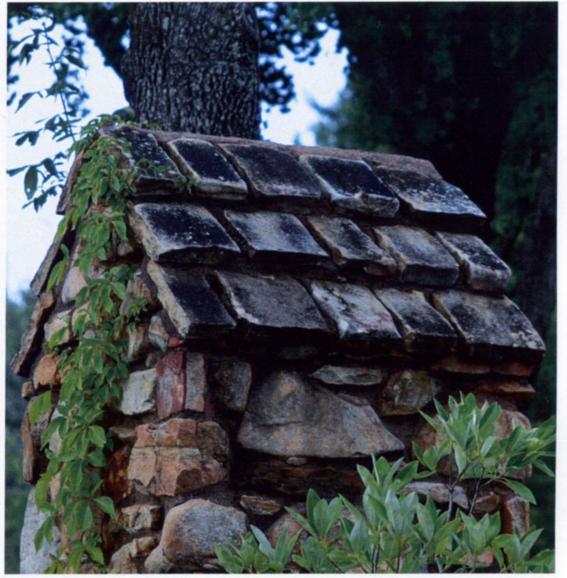
An unusual example of sandstone being used as a roofing material. This application is found in England on much older houses, but rarely found in this area.