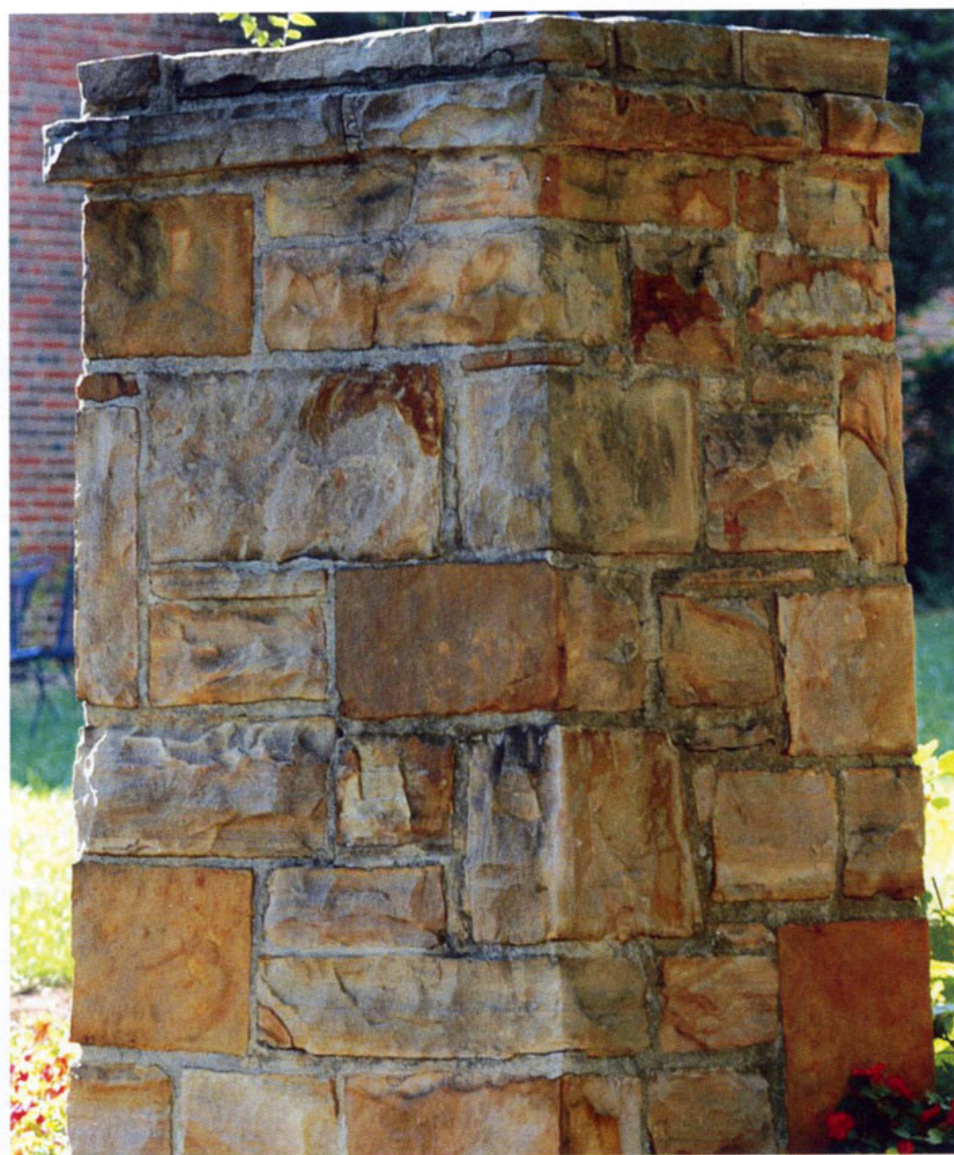
Stone pier with sandstone set both in the bedding plane and perpendicular to it.