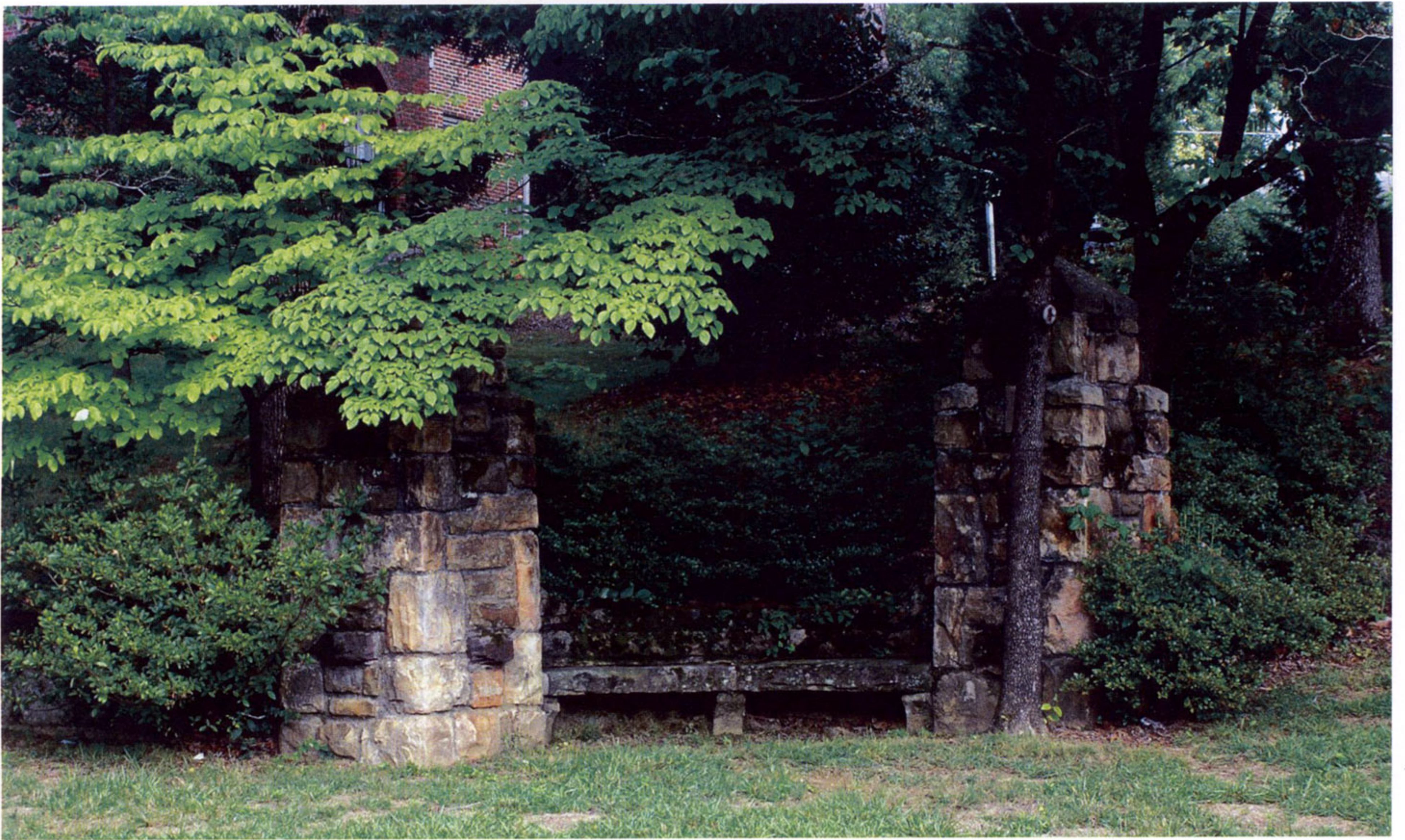
An entrance to a residential subdivision of the 1920s. The stone has only been dressed by chipping to make corners and the detail at the cap of the piers. Note that the bench is made of a slab of sandstone with sandstone supports.