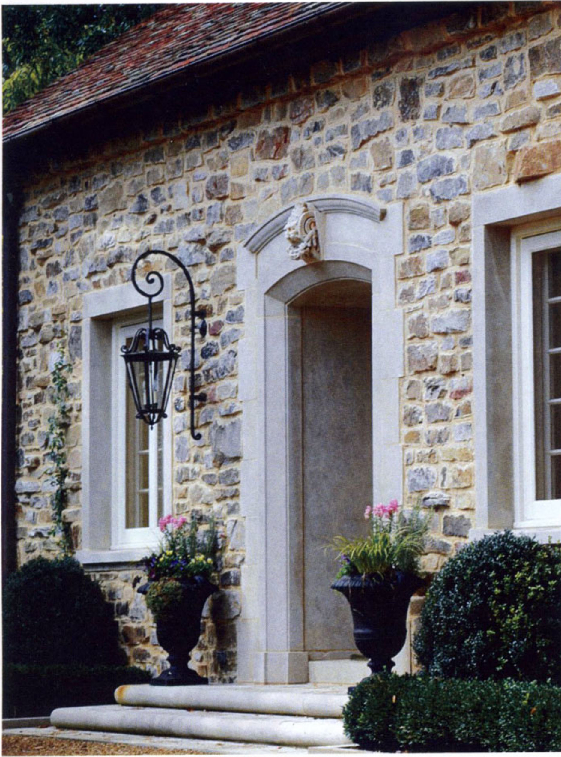
Weathered sandstone wall with limestone trim.