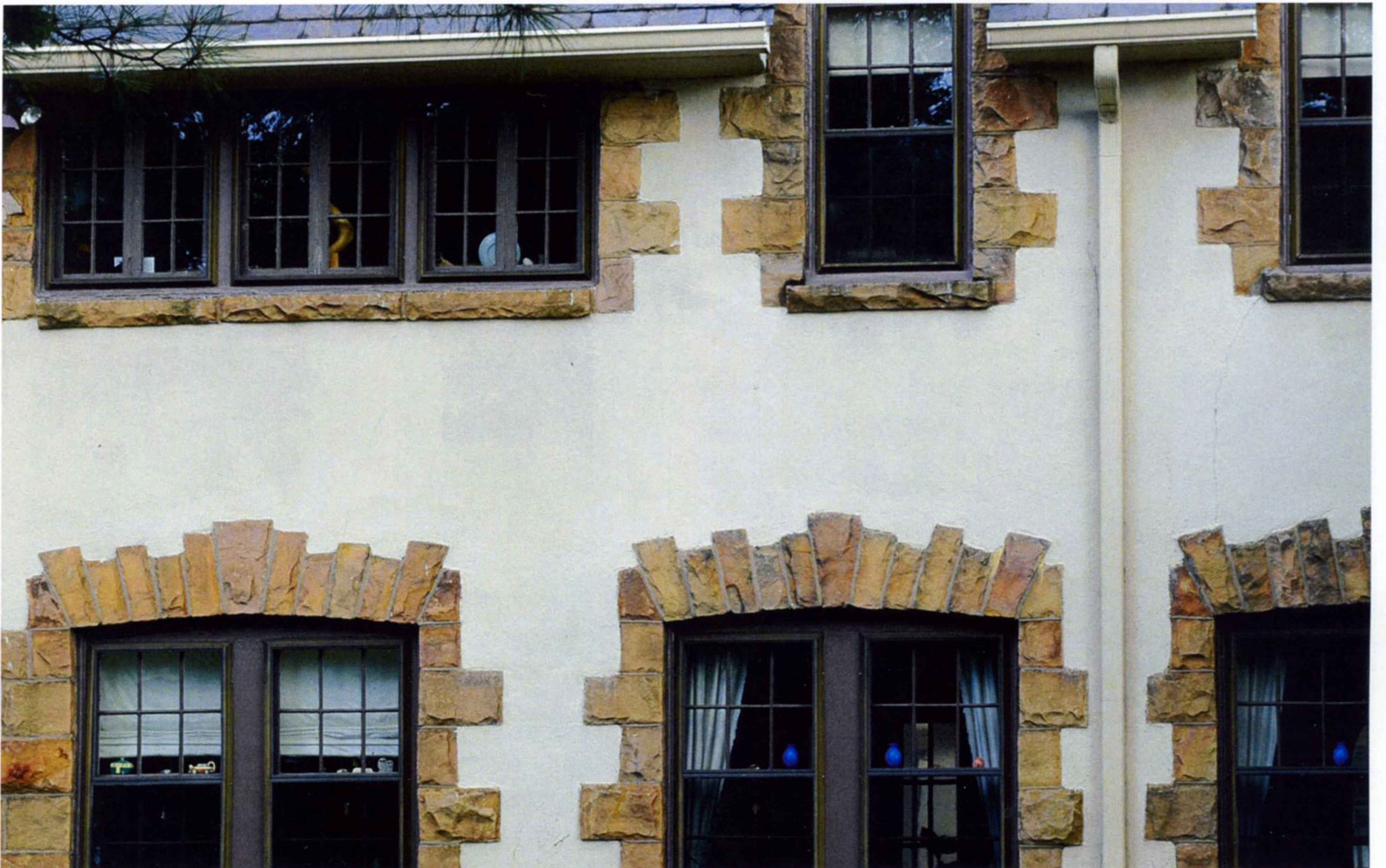
An example of sandstone used in the dressing around windows of a stucco house. The stone is irregular but with corners probably chipped to make somewhat square.