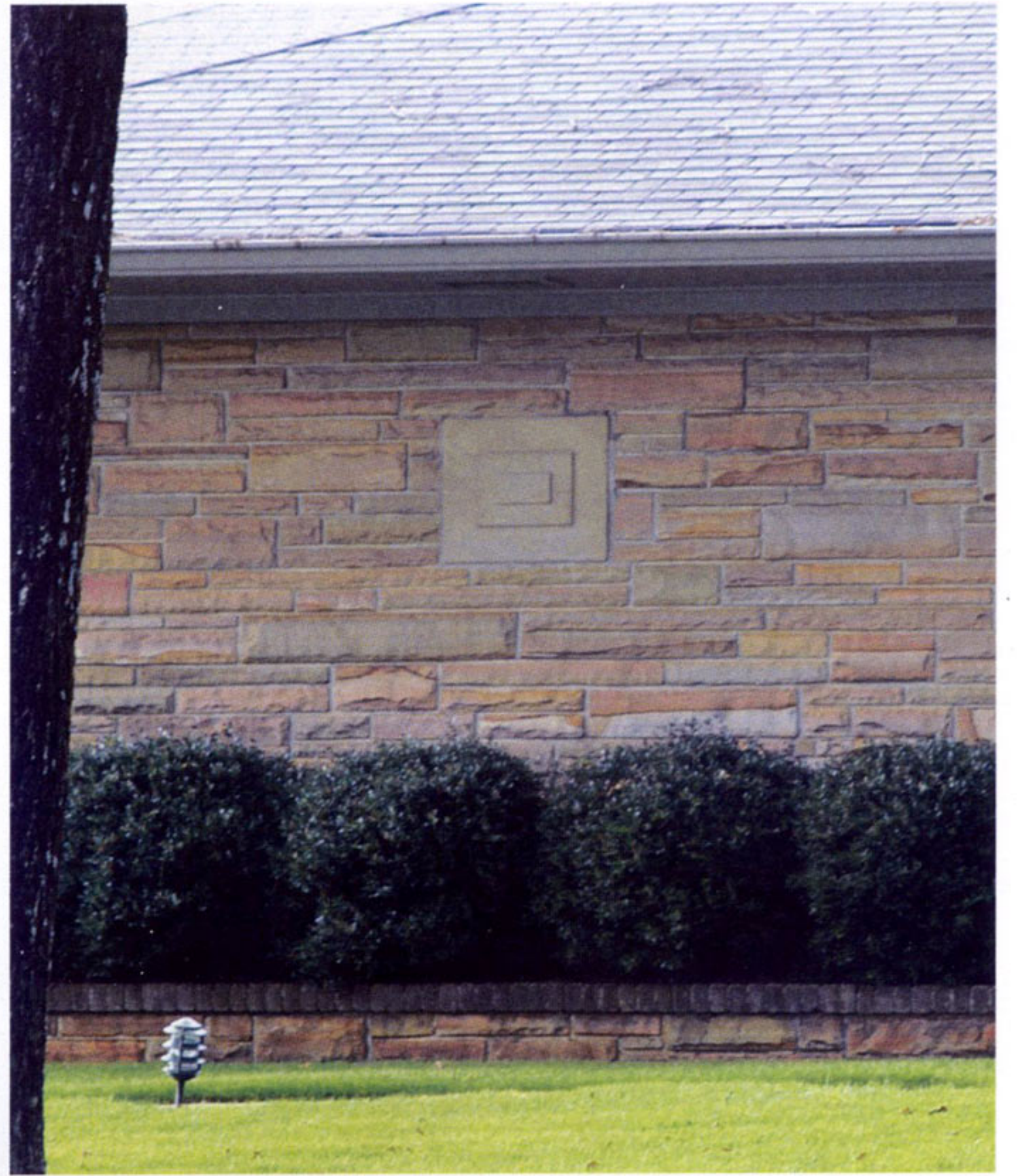
Another example of stonework of the 1950s. Note that the stone was normally set under deep overhanging eaves which protects the original color of the stone from weathering.