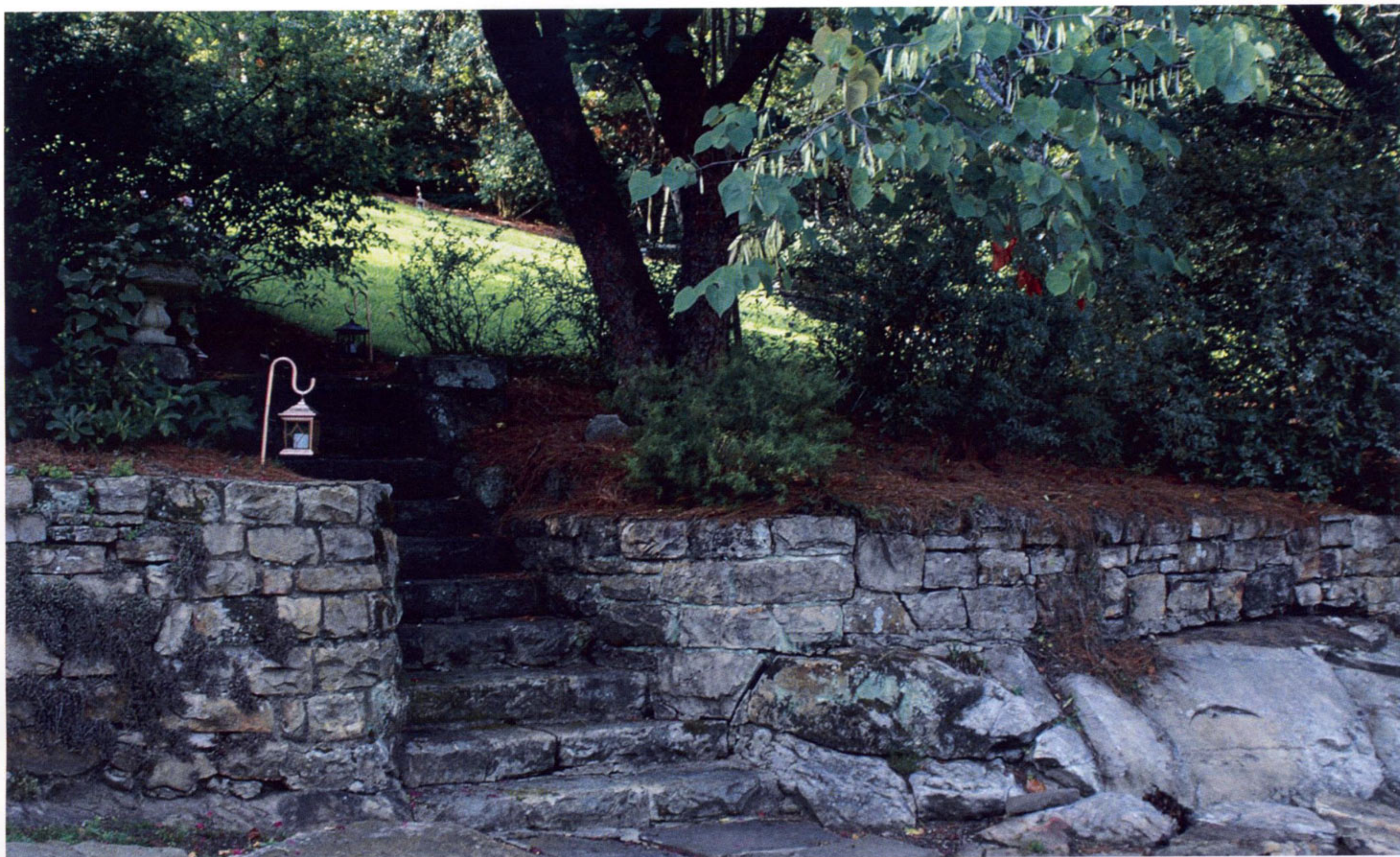
Sandstone retaining wall sitting on top of a natural sandstone outcropping, with stairs built into the stone landscape.