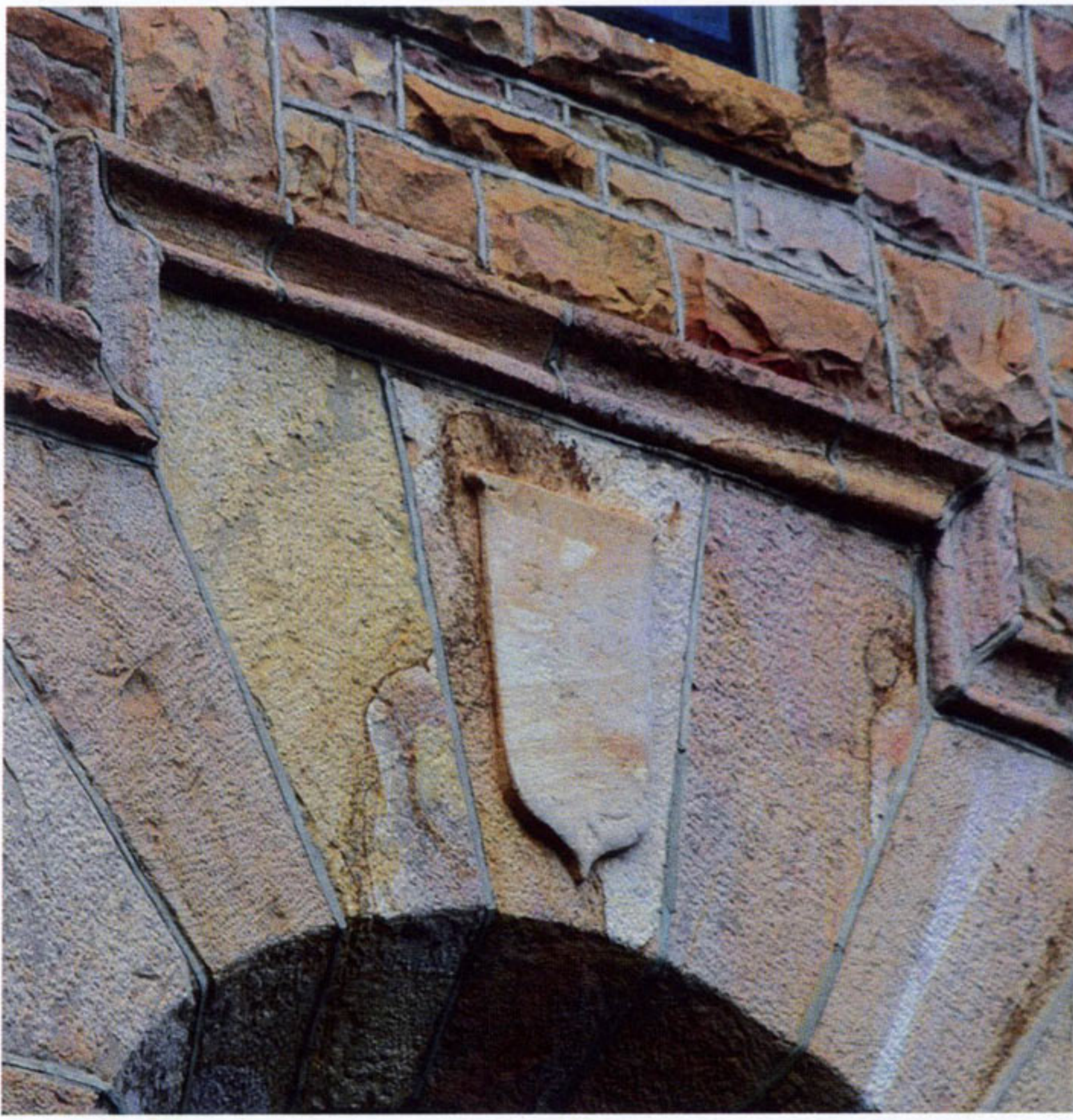
This is an example of sandstone trim at openings where the sandstone has been dressed to a smooth surface and edged by mouldings. This is an unusual application for sandstone because of the hardness of the stone. Limestone, which is softer, is normally used for detailed trim.