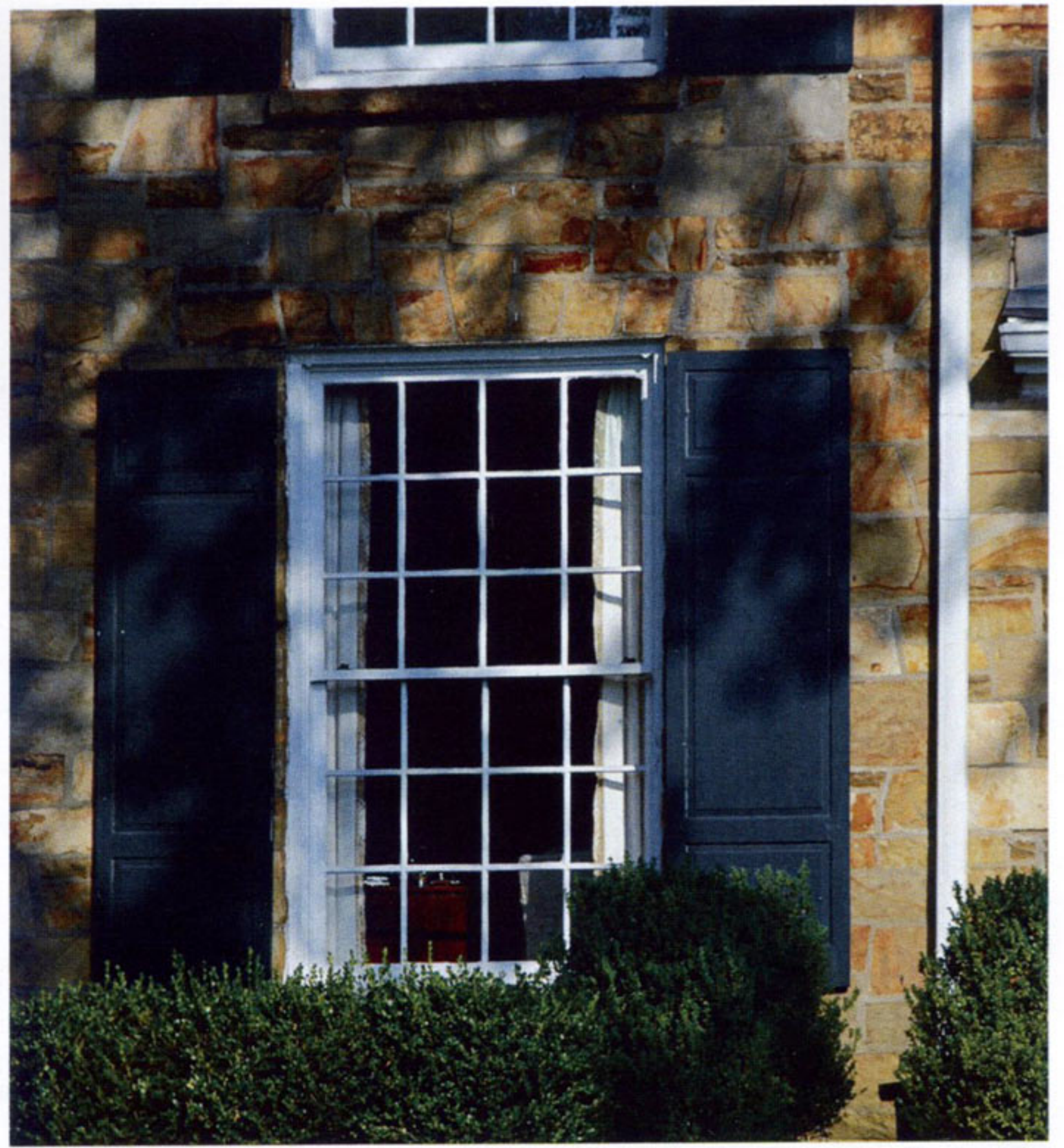
This example shows the stone being used perpendicular to the bedding of the stone.