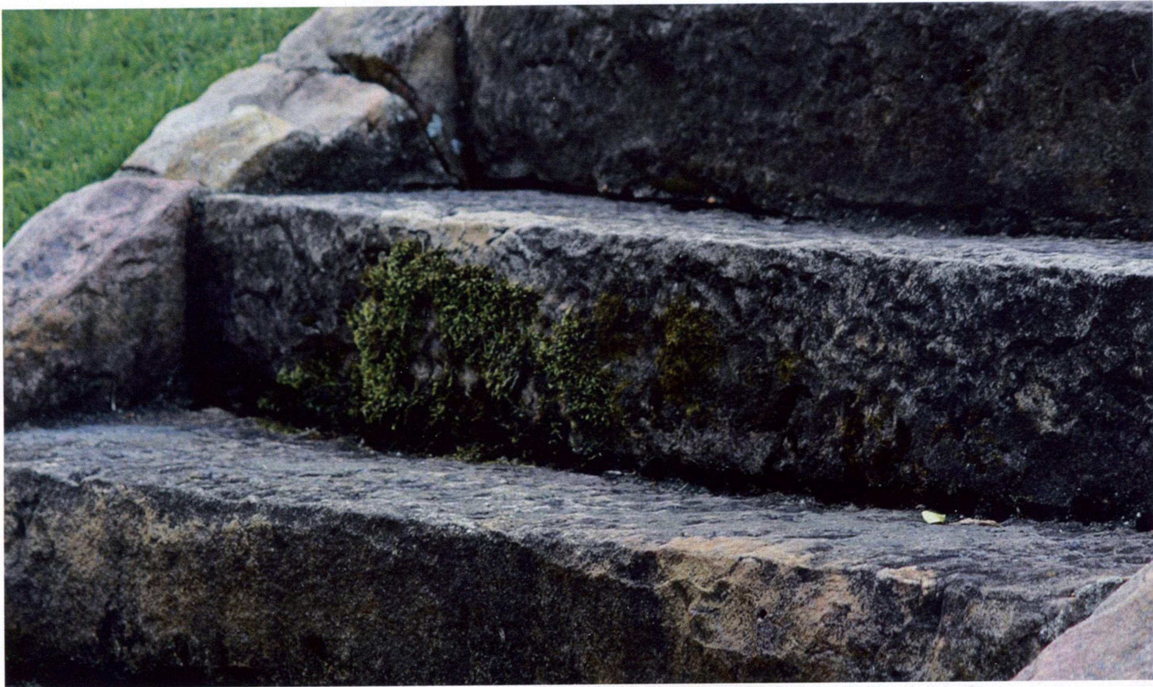
An example of solid stone treads with stone stringers.