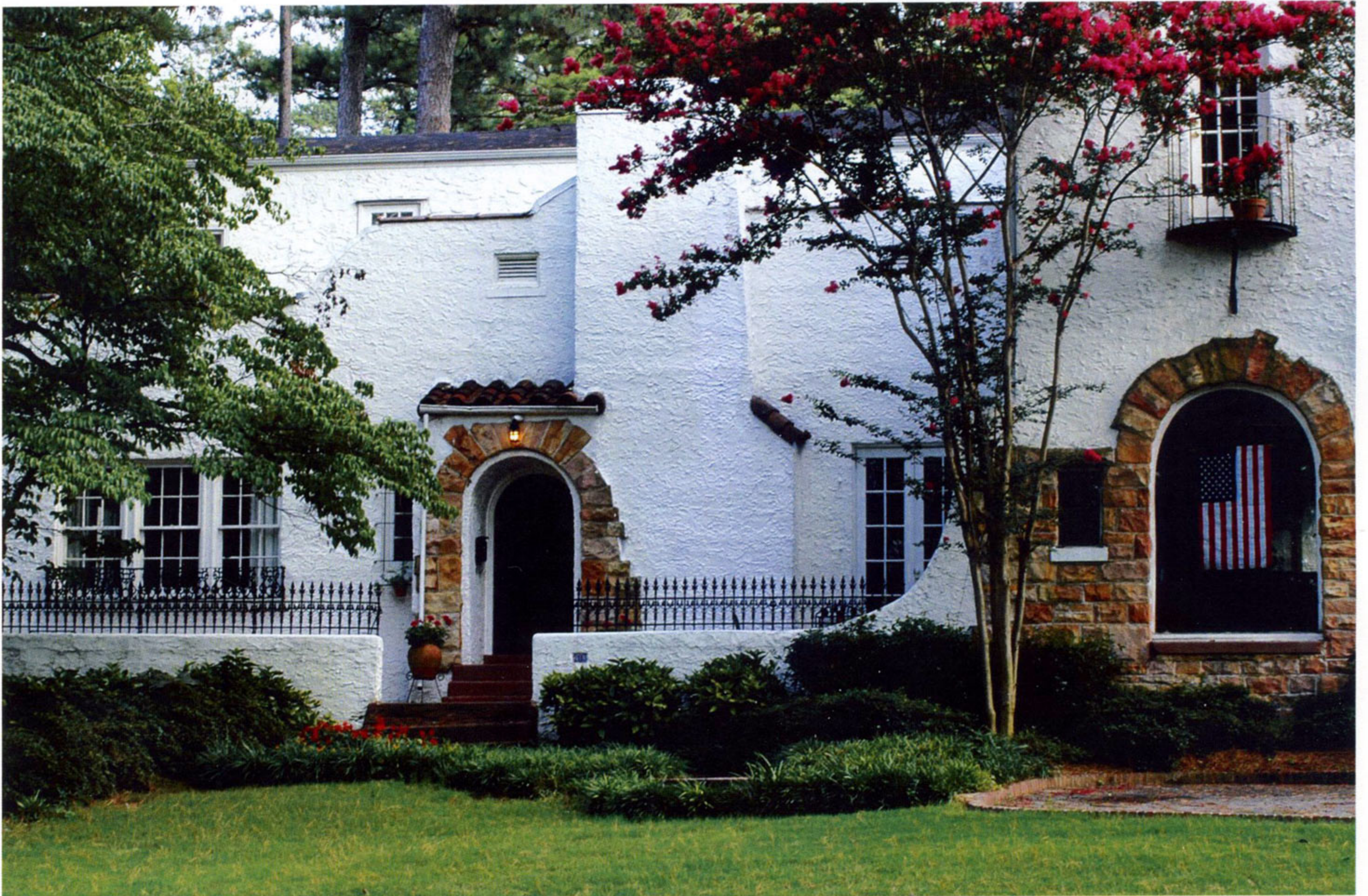
Another example of stone dressing in a stucco wall.