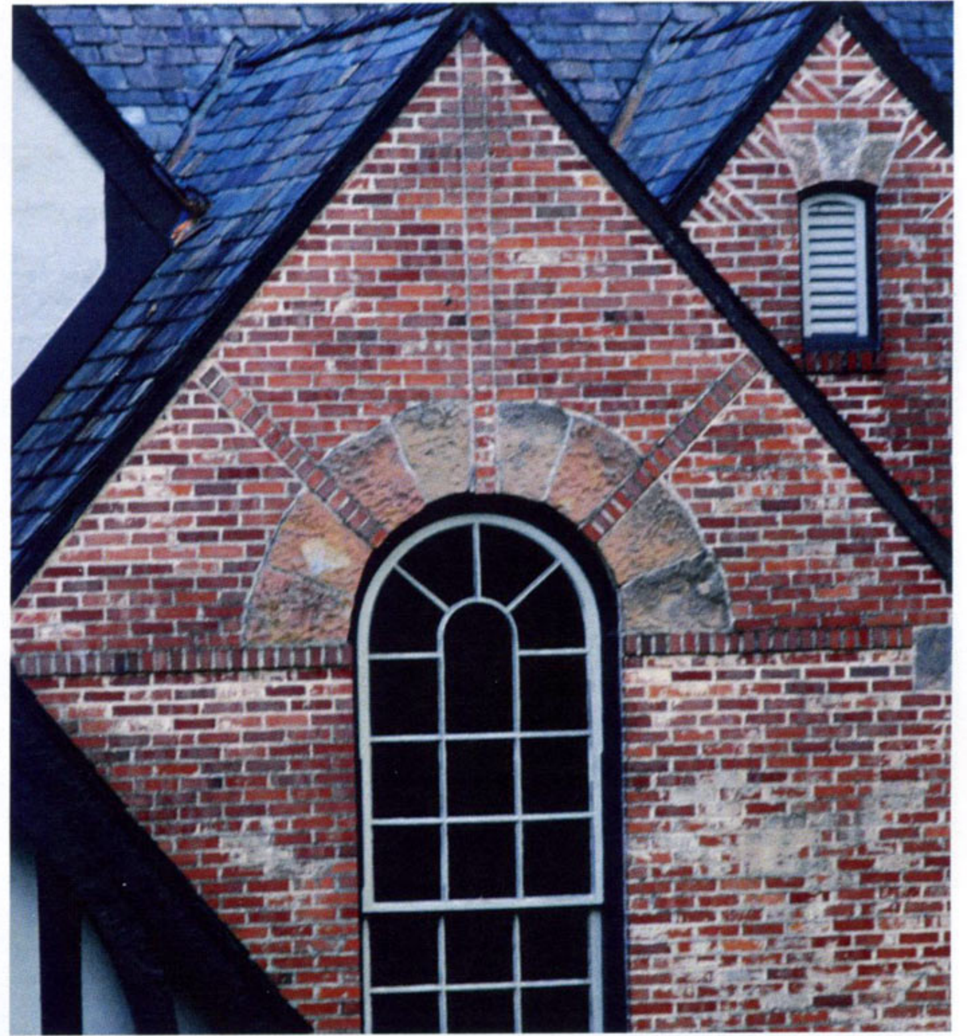
A house of the late 1920s with dressed sandstone in the brickwork of the arch. A very good example of using the color and texture of sandstone with brick.