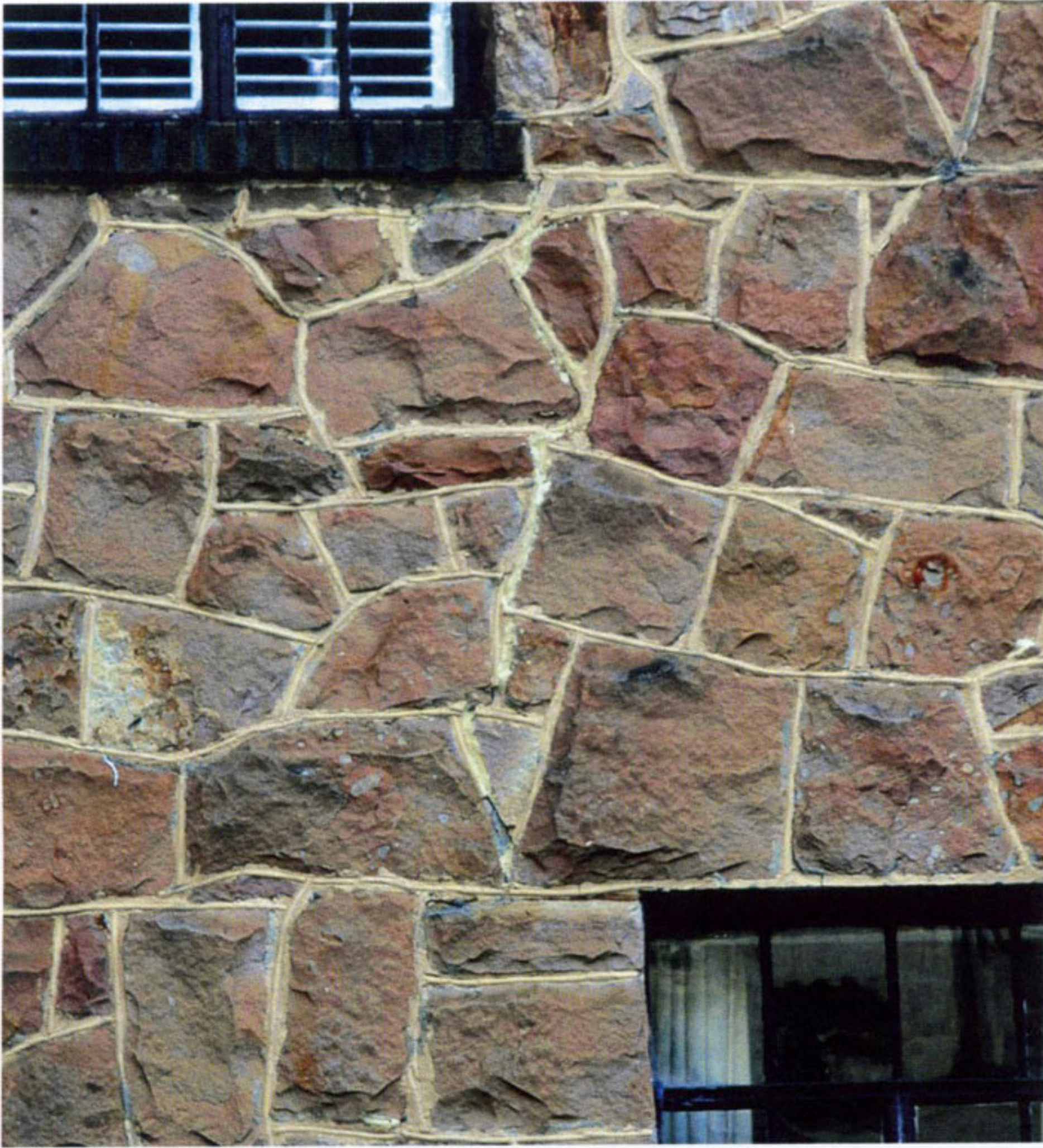
Sandstone set in an irregular pattern with particular attention to the fitting of the stone in relation to one another.