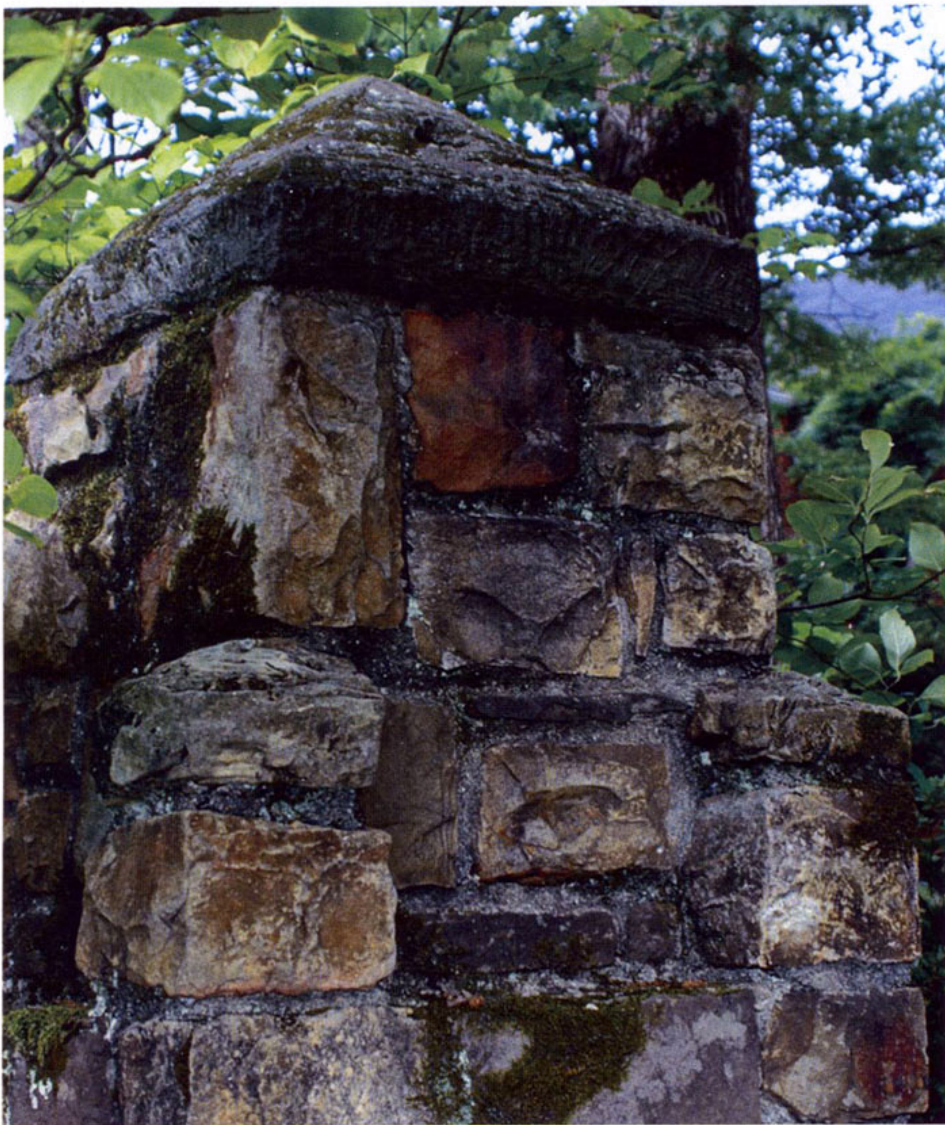
Detail of the subdivision entrance showing the dressing of the cap piece.