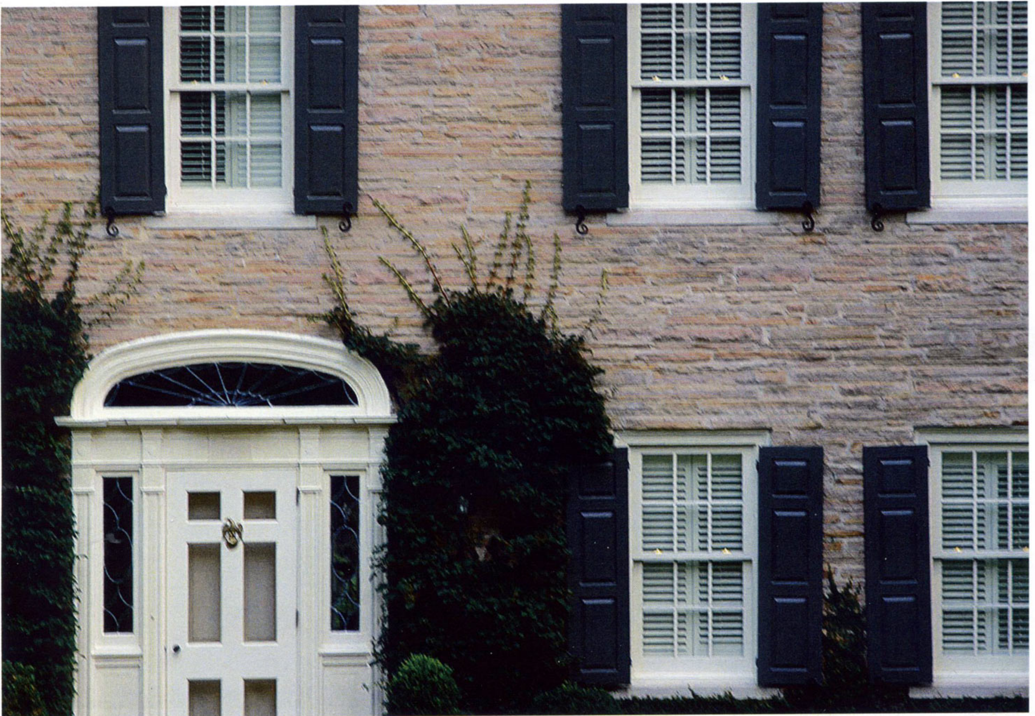
An example of sandstone set in thin pieces of stone in a very controlled pattern.