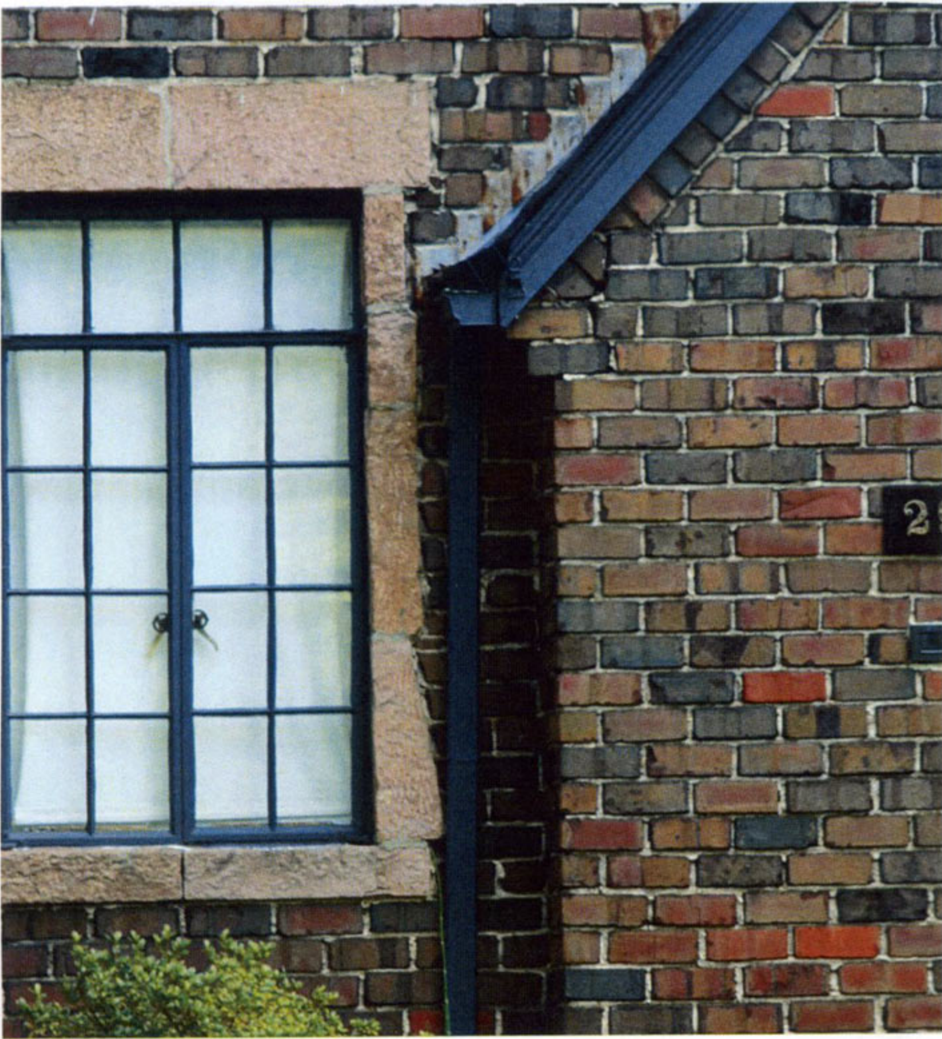
Dressed sandstone with a smooth surface in a brick wall.